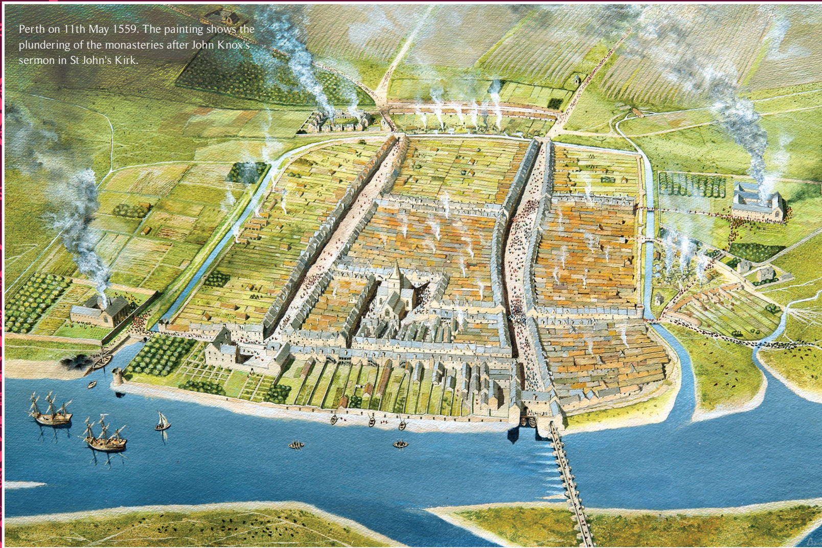
Perth on 11th May 1559. The painting shows the plundering of the monasteries after John Knox's sermon in St John's Kirk.

Perth was a good place to live in medieval times. Its location at an important cross roads for Scottish trade made it rich and influential. The River Tay here is tidal and deep enough to allow small ships to moor. It is also the lowest safe crossing point. By road or river, Perth was easy to reach from all parts of Scotland.