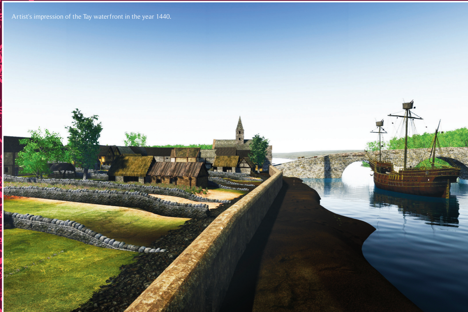
Artist's impression of the Tay waterfront in the year 1440.

If you were standing here in medieval times, you'd probably have soggy feet. That's because you would be on the shoreline in someone's back yard. If you were really unlucky, there would be flooding, as has happened so often in Perth. Beneath Perth's buildings and streets, water-logged soils have, remarkably, preserved many things that have been buried.