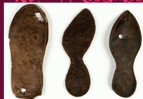
Leather shoes and a gold brooch inlaid with niello (a dark compound of silver) found during excavation work in Perth city centre.