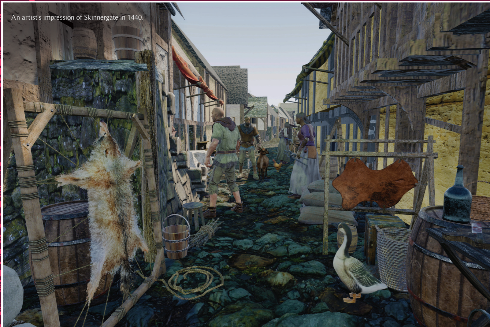
An artist's impression of Skinnergate in 1440.

Skinnergate was the main thoroughfare into Perth from the north. Here, just inside the burgh, the animal skinnners and leather craftsmen lived and worked. Medieval Perth was densely packed, with people, livestock and workshops within the houses. Everyone wanted to live inside the burgh walls for protection and privileges. Perth was called a craftis toun because of the quality and variety of its products. Its skilled workers were organised in guilds and incorporations. People from all over Scotland visited on fair days to buy much-valued goods. Many of those were also exported widely.