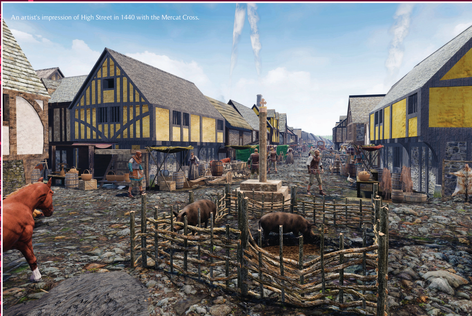
An artist's impression of High Street in 1440 with the Mercat Cross.

Look for the octagonal stone in the middle of High Street. This is where Perth's Mercat (market) Cross stood in medieval times. Markets were held on set days where you could trade gold, silver, precious stones, animals, hides, leather goods, wool and cloth. You could buy pottery, knives, soap, clothes, grain, wine, beer, spirits, fish and meat from pigs, sheep, goats, cattle and deer. On special days in the church calendar, there were bigger fairs with traders from further afield, larger crowds, noisier celebrations and more entertainment.