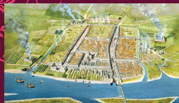
Perth on 11th May 1559, the day when John Knox preached.