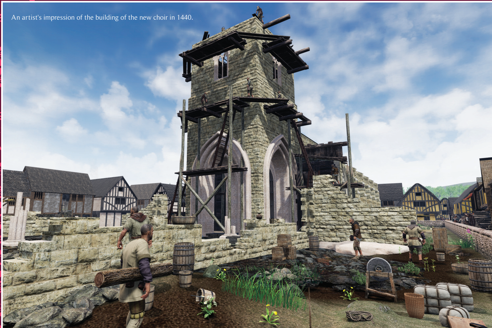
An artist's impression of the building of the new choir in 1440.

The oldest church in Perth, St John's Kirk, may date back to the early 11th century. This was about 200 years before the town was granted the status of royal burgh in 1208. John Knox preached here in 1559, kindling the Protestant Reformation in Scotland. The burgh's graveyard surrounded the kirk until it became completely full in 1580. Five hundred years of burials raised the ground - that's why you have to step down into the kirk.