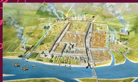
Perth on 11th May 1559.