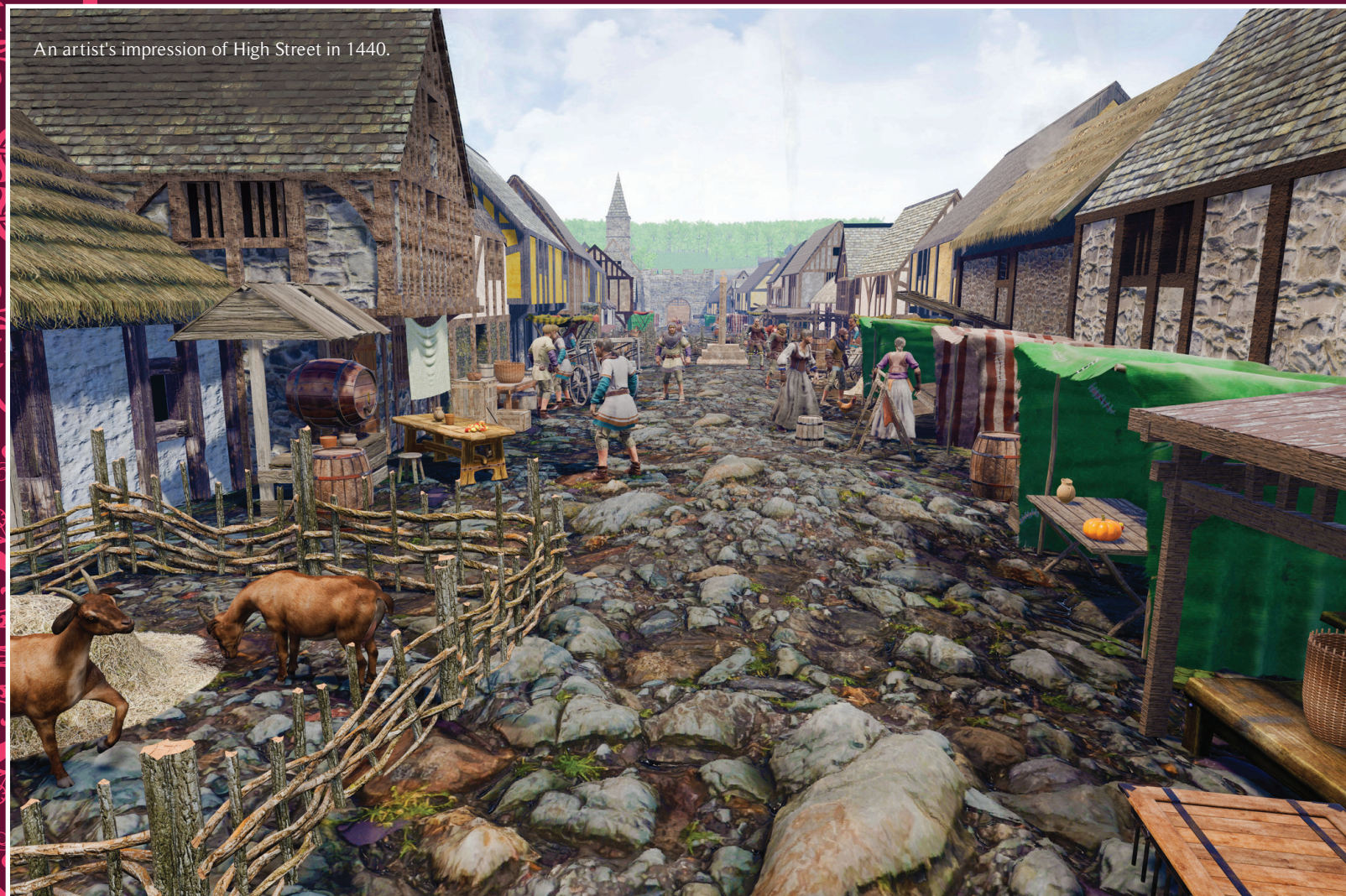
An artist's impression of High Street in 1440.

Here, in medieval times, you would be standing outside one of Perth's many ports (entrance gates). As a trader, guiding your animals or carrying your goods, the crowds would jostle you. Markets and fairs were regular, grand affairs. Rich and poor would mingle with livestock, entertainers and pickpockets. Walk down High Street and imagine the people, animals, noise, smells, shouting and laughter. You will eventually arrive at the Mercat (market) Cross. It was here that proclamations and announcements were made.